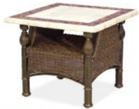
6627TRBG Travertine Stone Top End Table