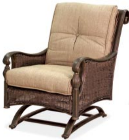
66211BG Spring Lounge Chair