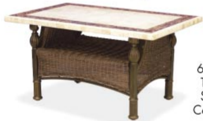
6643TRBG Travertine Stone Top Coffee Table