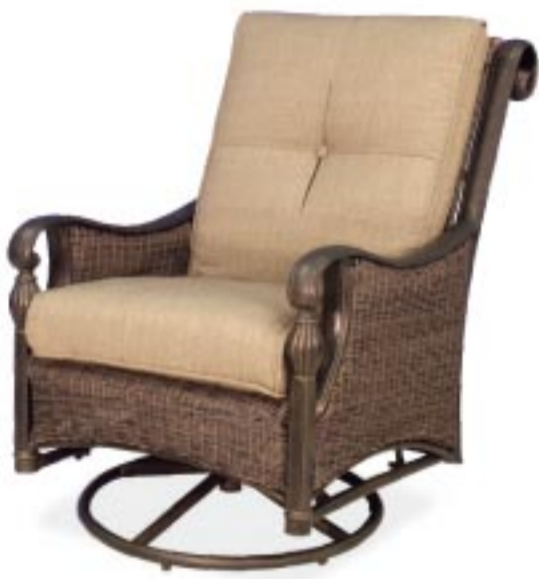
66212BG Swivel Glider Lounge Chair